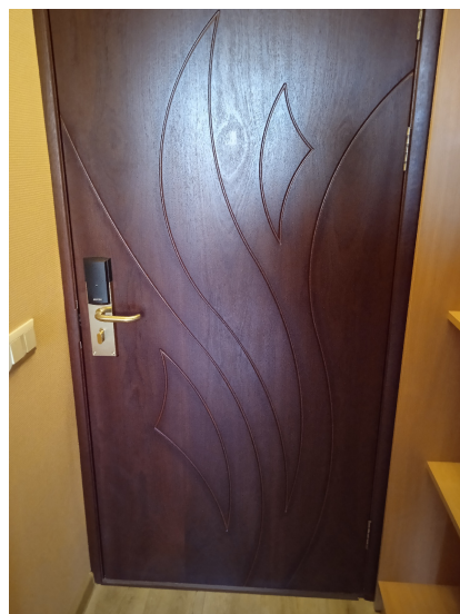
Isn't often you find a door you want a picture of.