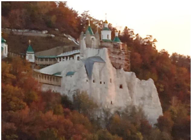
This is the oldest part of the Monastery.