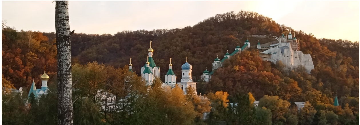
View of Monastery from across the river.